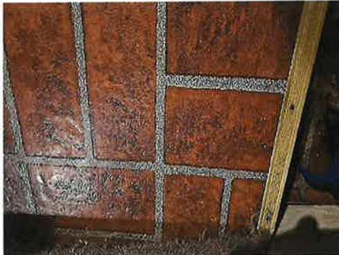
706-1 Rolled Flooring/Mastic Interior Kitchen