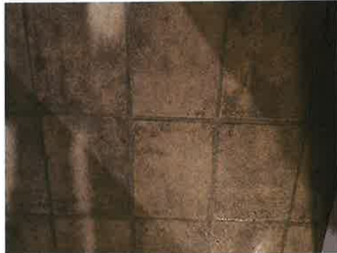
706-2 Rolled Flooring/Mastic Interior Bedroom C