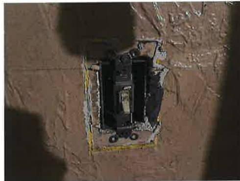
706-4 Drywall/Joint Compound Typical Interior Walls/Ceilings