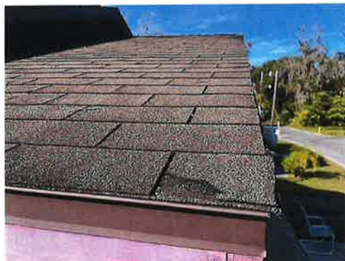
706-5 Asphalt Shingle Typical Exterior Roof