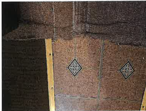
706-3 12"x12" Floor Tile/Adhesive Interior Living Room